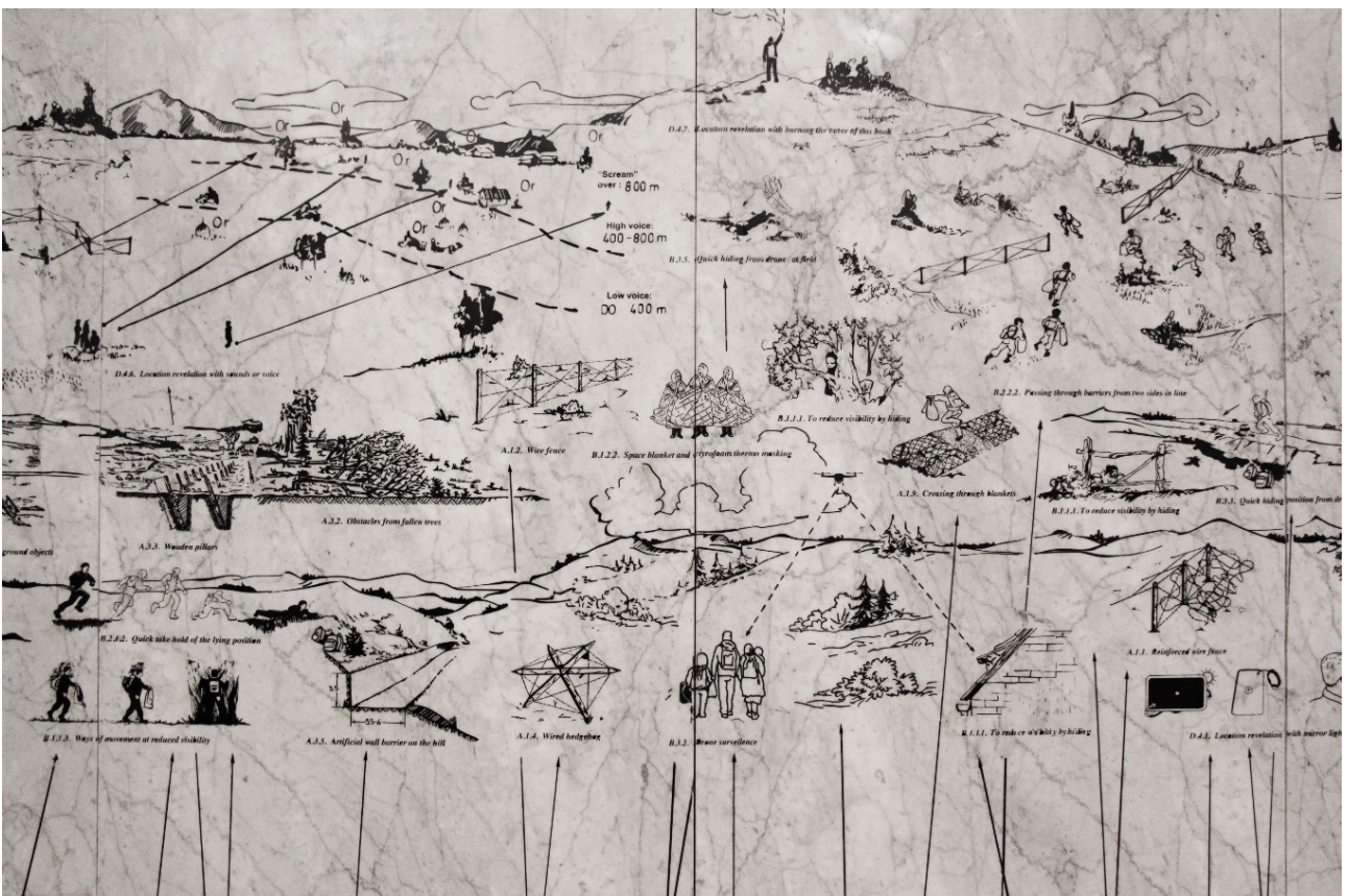
The Didactic Wall, 2019. Detail. Photo by Mladen Miljanović.