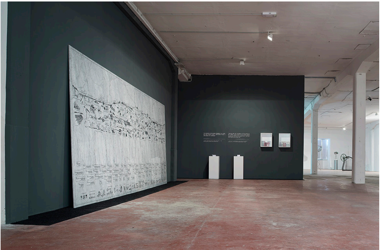
The Didactic Wall, 2019. Installation View at the Tense Present exhibition, KIBLA Portal, Maribor, SI.